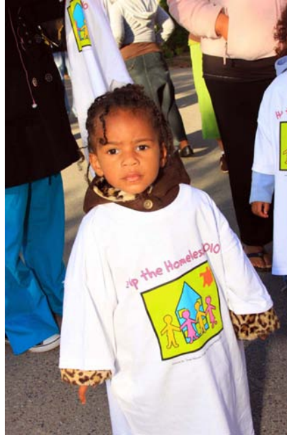
One of NCCF's youngest supporters