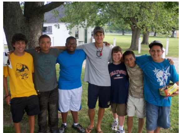
Camp Wabanna campers enjoying a group activity

Our NCCF children and youth traveled to Edgewater, Maryland, and stayed for a weeklong summer camp on a 23-acre point where the Rhode and West Rivers converge into the Chesapeake Bay, to swim and canoe.