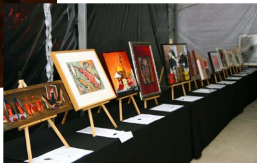
Art & Soul 2009 Original pieces of artwork on display for the Art & Soul Silent Auction