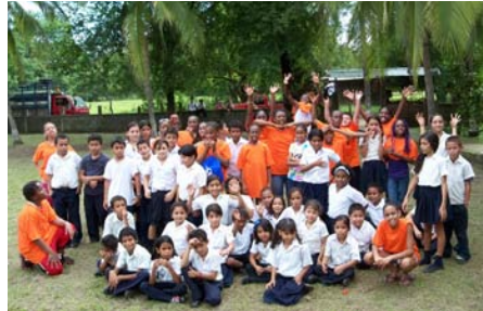
JC Nalle Community school students enjoying a visit with the students from Santa Rita Elementary School.

After a visit to Volcano Miravalles, students learned how the heat pressure from the volcanoes creates