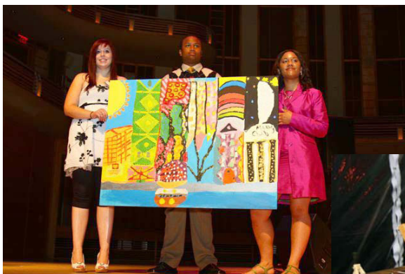
Art & Soul 2010 GAP Youth Live Auction