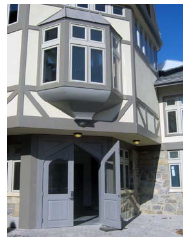
Entrance of the Freddie Mac Foundation Youth Activities Center

This new facility is poised to serve between 2,000 and 3,000 children, youth and families each year in a comprehensive community setting with athletic, educational, artistic and spiritual programs. A majority of the programs will be volunteer-led, utilizing our current pool of over 800 volunteers. It will include six “in residence” programs that we have designed with our community partners: Dance, Music, Cooking, Art, Non-denominational Spiritual Education, and Theatre. The building will also facilitate future partnerships, utilizing the full-court gymnasium and photography/multi-media studio.