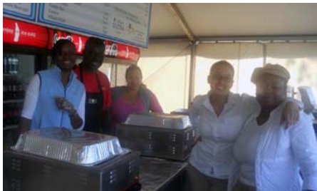
Volunteers from Lexis Nexis and Avendra donate their time at the golf tournament.

For a second year, NCCF partnered with PROM Catering at the Constellation Energy Senior Players Championship golf tournament. More than 150 volunteers gave their time to sell food and beverages to hundreds of PGA golf fans from October 4th - October 10th in Potomac, Maryland. NCCF will receive a portion of the concession sales which are designated towards equipping the Freddie Mac Foundation Youth Activities Center (YAC). A special thanks to our dedicated volunteers, and the following groups: Fannie Mae, Avendra, and MITRE, for organizing and supplying groups of energetic and motivated volunteers. We could not do it without you!